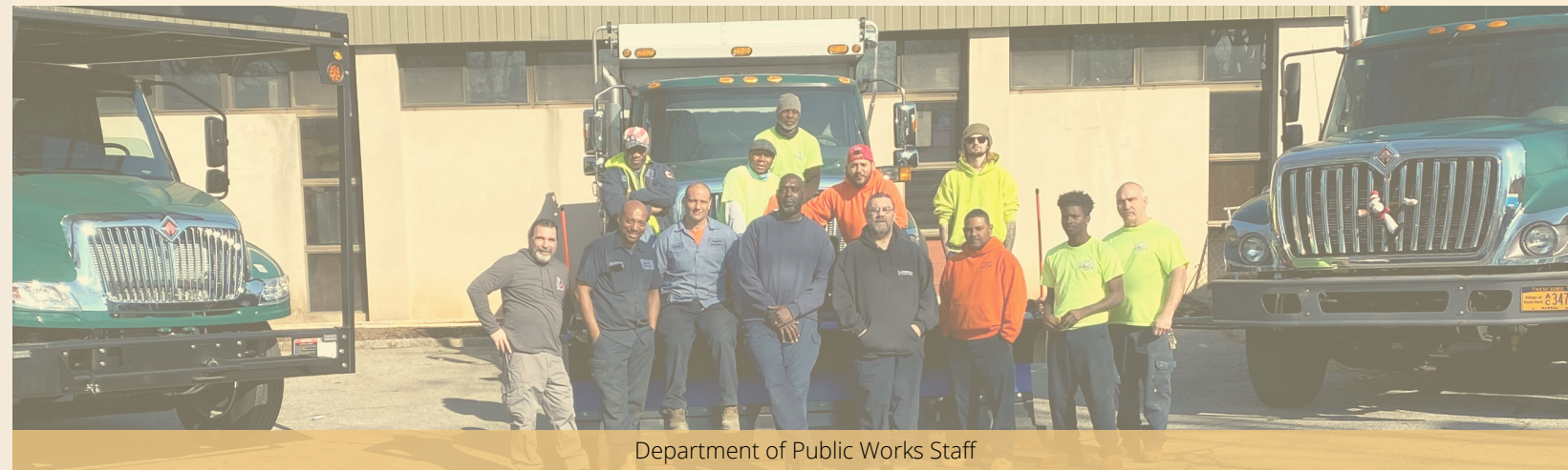
Department of Public Works Staff

All recyclables will be collected Wednesday EXCEPT for the weeks that include a holiday. During those weeks, recycling will be collected Thursdays.